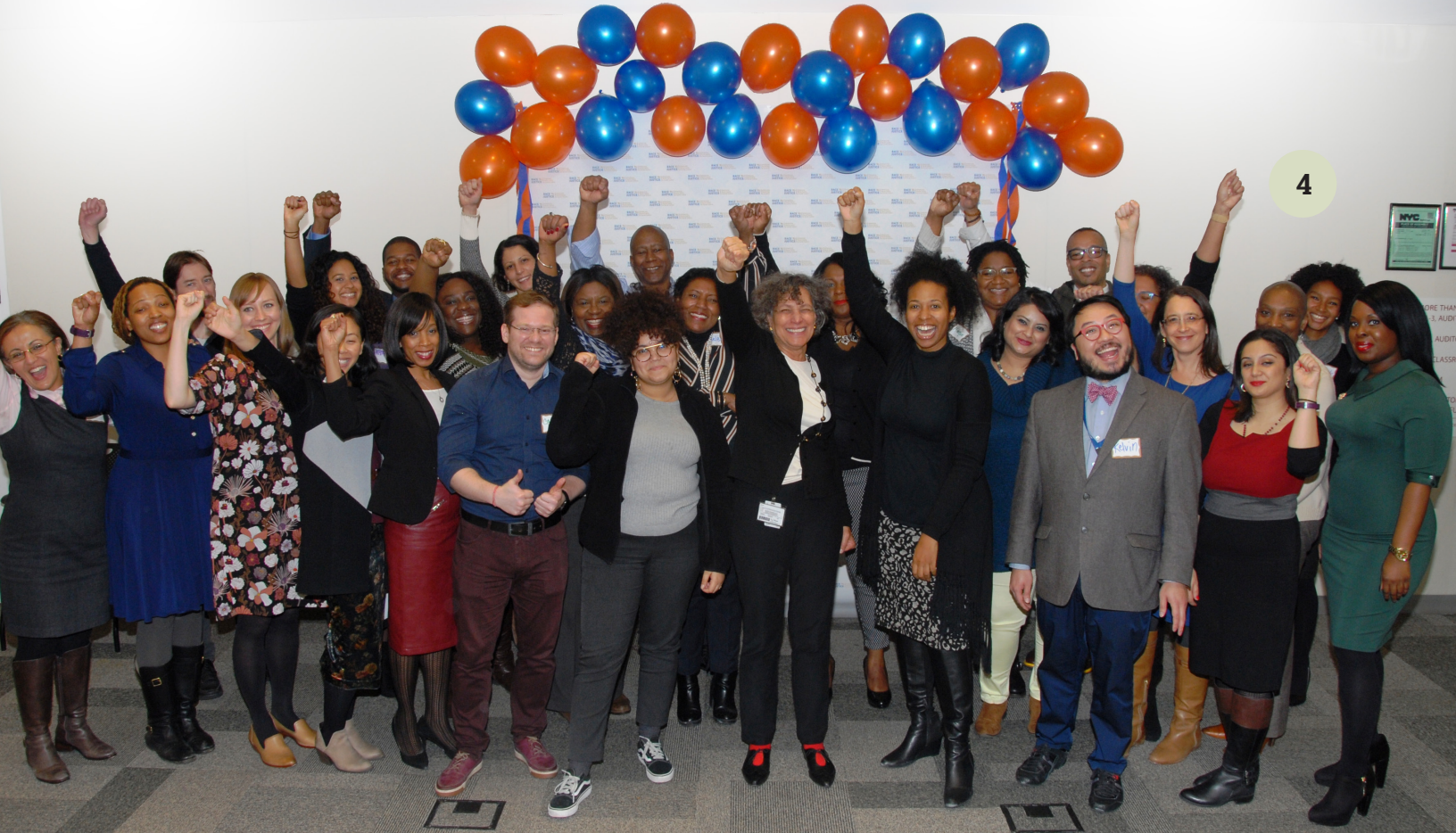
ABOVE: Racial Equity Core Team, New York City Department of Public Health and Mental Hygiene.