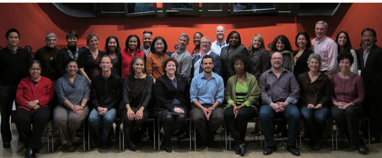
LEFT: The Inter Branch Team, King County, WA.

Ultimately, the goal of the Core Team is to reach and engage all units and levels of an institution—and every employee—in using a racial equity framework (analysis, tools and strategies) in their daily work and routine decisions. The work of racial equity is critical to the mission of any government jurisdiction that truly wishes to engage and serve all of its constituents fully and fairly. By doing so, jurisdictions can move from being passively part of the problem to actively part of the solution. When the Core Team increasingly and continually embeds the vision and values of equity in all facets of governance, an inclusive democracy and an equitable community become possible.