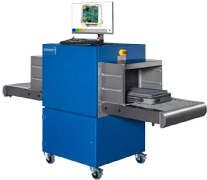
Smiths Detection X-ray