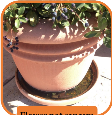
Flower pot saucers

Mosquitoes lay their eggs in standing water. Here are some common sources of mosquito breeding in backyards to keep an eye out for. Check these places weekly for standing water and dump it out or treat it with a bacterial larvicide.