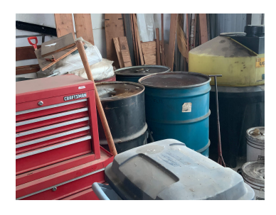
Inspector note: Store excess of 10 gallons of flammable/combustible liquids inside flammable cabinet(s) or remove from hangar. Violation is due to be rechecked on 06/01/2021

5704.3.4.4 Liquids for maintenance and operation of equipment. In all occupancies, quantities of flammable and combustible liquids in excess of 10 gallons (38 L) used for maintenance purposes and the operation of equipment shall be stored in liquid storage cabinets in accordance with Section 5704.3.2. Quantities not exceeding 10 gallons (38 L) are allowed to be stored outside of a cabinet where in approved containers located in private garages or other approved locations.