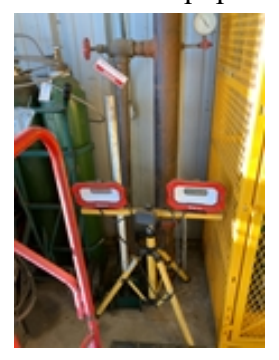
Inspector note: Provide and maintain unobstructed pathway to the fire sprinkler riser. Violation is due to be rechecked on 06/01/2021

509.2 Equipment access. Approved access shall be provided and maintained for all fire protection equipment to permit immediate safe operation and maintenance of such equipment. Storage, trash and other materials or objects shall not be placed or kept in such a manner that would prevent such equipment from being readily accessible.