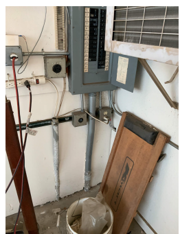
Inspector note: Maintain clearance around the electrical panel. Corrected during inspection.

604.3 Working space and clearance. A working space of not less than 30 inches (762 mm) in width, 36 inches (914 mm) in depth and 78 inches (1981 mm) in height shall be provided in front of electrical service equipment. Where the electrical service equipment is wider than 30 inches (762 mm), the working space shall be not less than the width of the equipment. Storage of materials shall not be located within the designated working space. Exceptions: 1. Where other dimensions are required or allowed by the California Electrical Code. 2. Access openings into attics or under-floor areas that provide a minimum clear opening of 22 inches (559 mm) by 30 inches (762 mm).