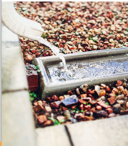
Aaga ay ku dhacayaab biyaha