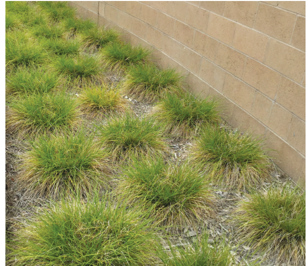
Geedaha ku haboon California