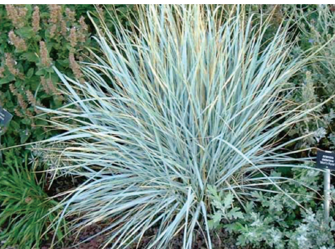
Canyon Prince Wild Rye