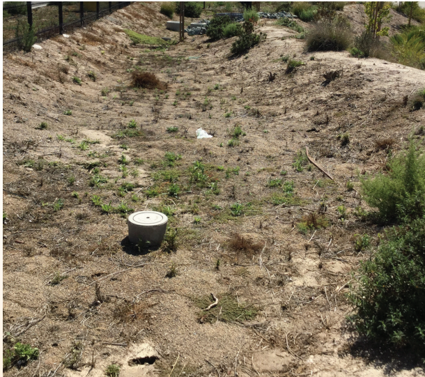
Beeraha caafimaadkoodu liito