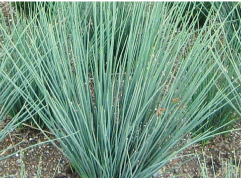
California Gray Rush