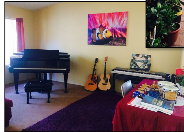
Milestone House STRTP