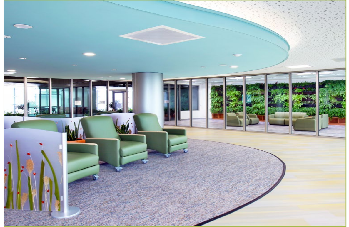
North Coastal CSU (Oceanside)