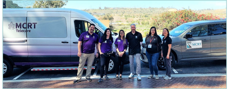
Providers of the County's Mobile Crisis Response Team

The Mobile Crisis Response Team (MCRT) program offers 24/7 mobile support to people experiencing a mental health or substance use-related crisis where they are, when they need it.