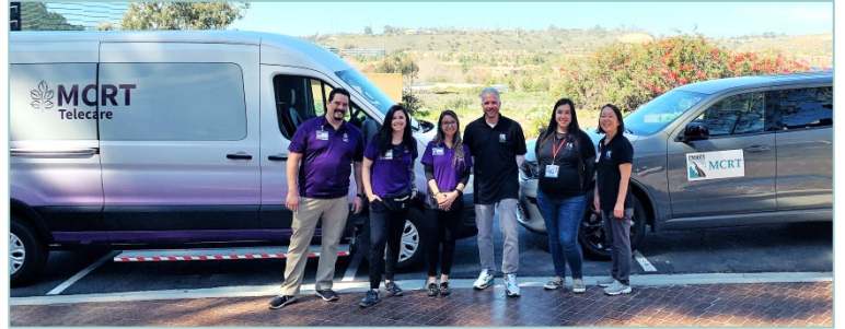
Bixiyayaasha Kooxda Jawaabta Dhibaataada Mobeelka Gobolka

Barnaamijka Kooxda Jawaabta Dhibaataada Mobeelka (MCRT) waxay siiyaan taageerada mobeelka oo 24/7 isbuucii dadka la kulmayo dhibaataada caafimaadka damiirka iyo isticmaalka maandooriyaha la xiriiri halkaasoo ay yihiin, markii ay u baahdaan.