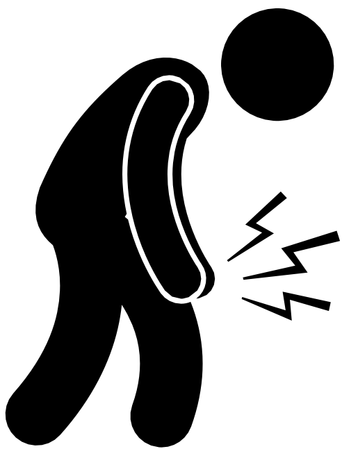
Xanuunka Kala goyska