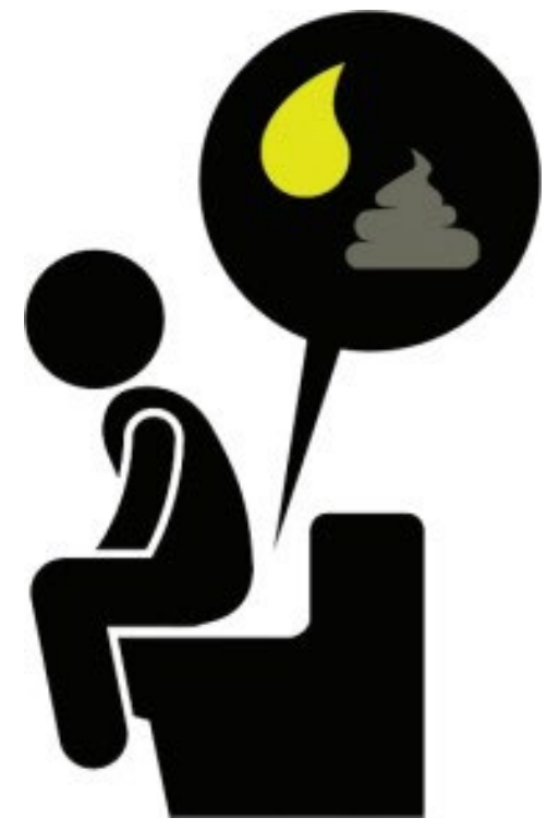
Kaadi madoow, saxaro xawiif ah, shubanka