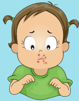
Rash around mouth