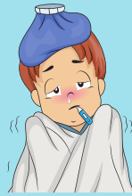
Fever and chills