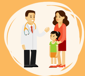
Doctor visit to confirm