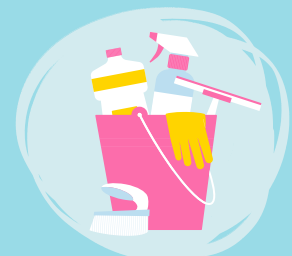
Wash all items used by the person with impetigo.