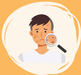
Red, leaky blisters