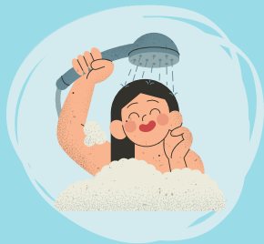
Keep skin clean, including hands, face and body.