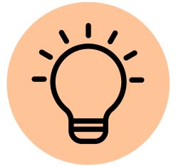
Sensitivity to Light