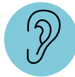
Otitis media (middle ear infection)