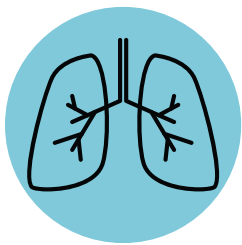
Pneumonia (lung infection)