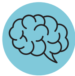
Meningitis (infection of the lining of the brain and spinal cord)