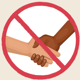
Avoid skin-to-skin contact with a person who has scabies.