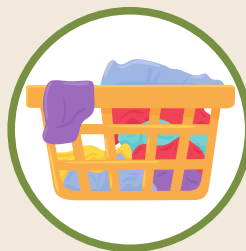
Wash and dry family towels, clothing, or bedding on hot water and hot dryer cycles.