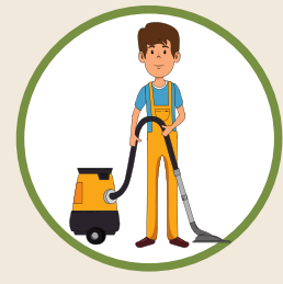
Clean and vacuum rooms where the person with scabies has been.