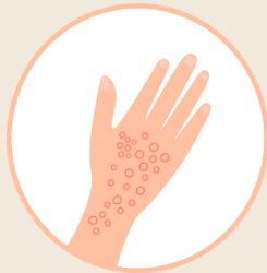
Red bumps or a bumpy rash.