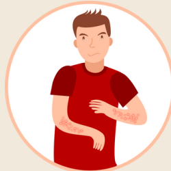
Severe itching, especially at night.