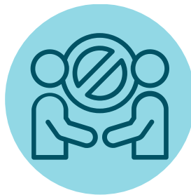
Avoid contact with a sick person