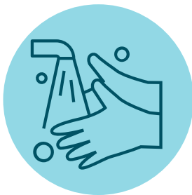
Wash your hands often