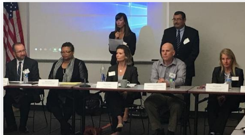
Cross-border Emergency Preparedness