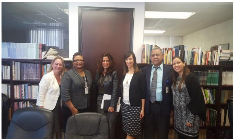
Collaboration with the Mexican Consulate