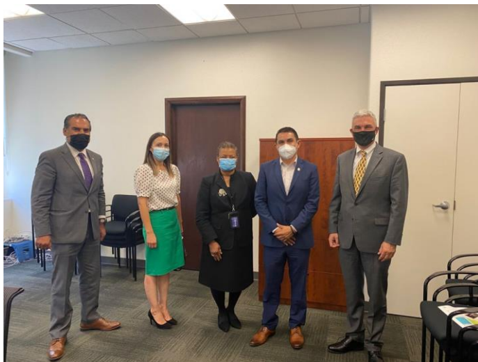
8/4/21 – meeting with BC Secretary of Health