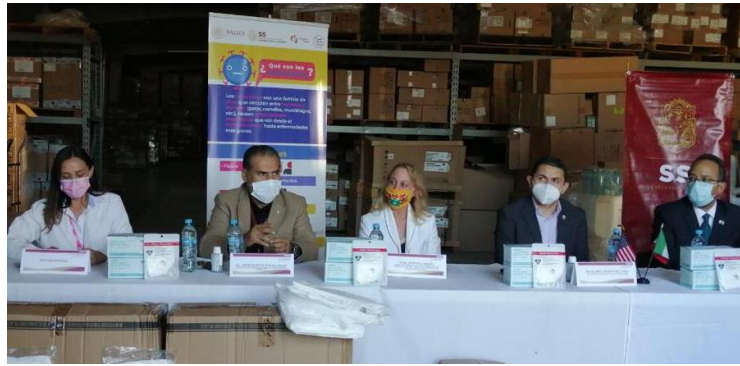
11/19/20 – cross-border PPE donation