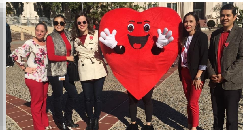
Love Your Heart / Ama Tu Corazón