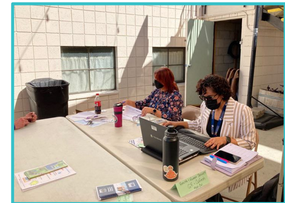
Community partners providing services at the Uptown Community Service Center