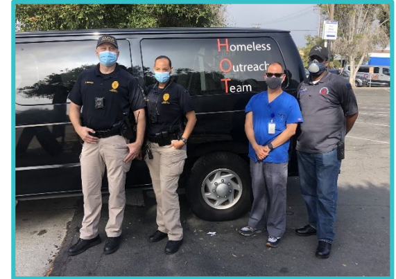
Homeless Outreach Team in Central Region