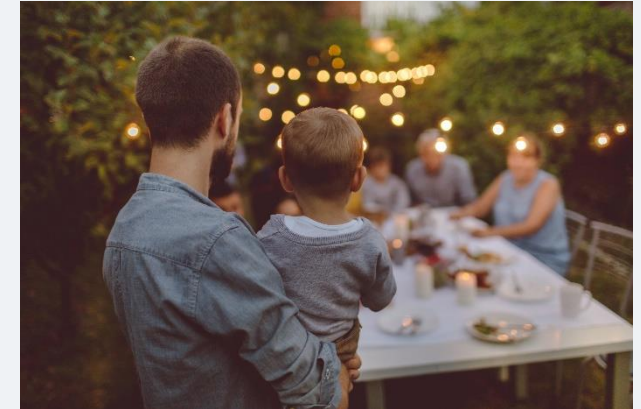
Dine In, Pick-Up, Delivery