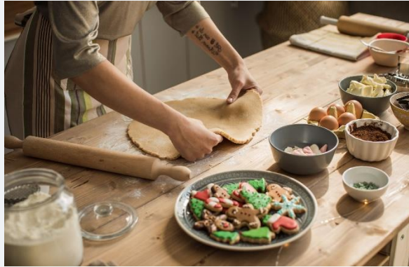
Home/Apartment/Condo Based Restaurant

30 meals/day or 90 meals/week $100K in gross sales