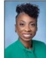
Monica Montgomery Steppe District Four