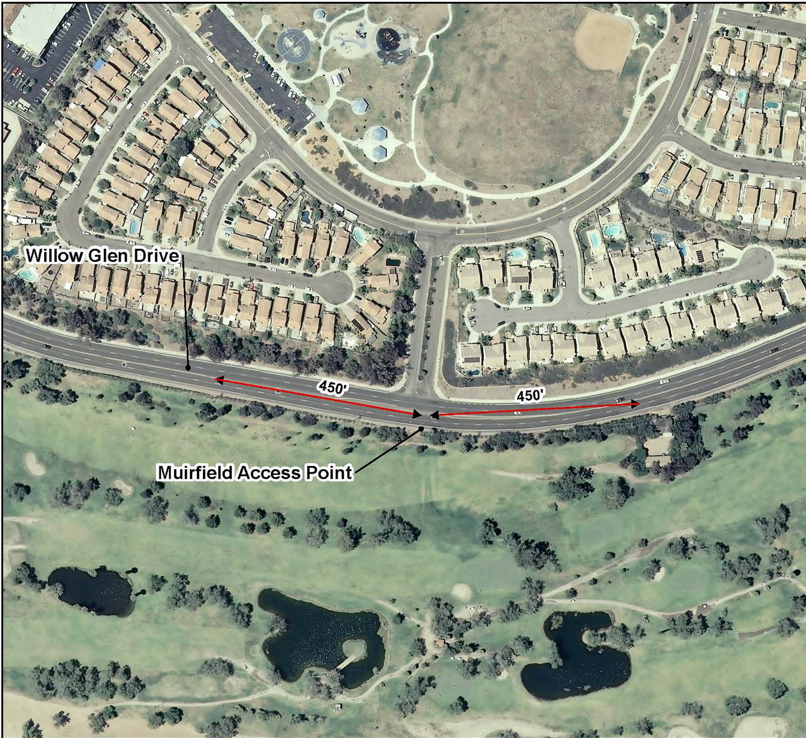
Figure 1 Cottonwood Sand Mine Muirfield Access Sight Distance Map