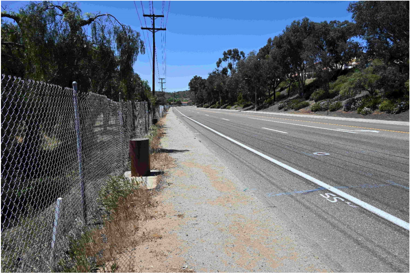
Figure 2. Looking West from Access to Willow Glen Drive