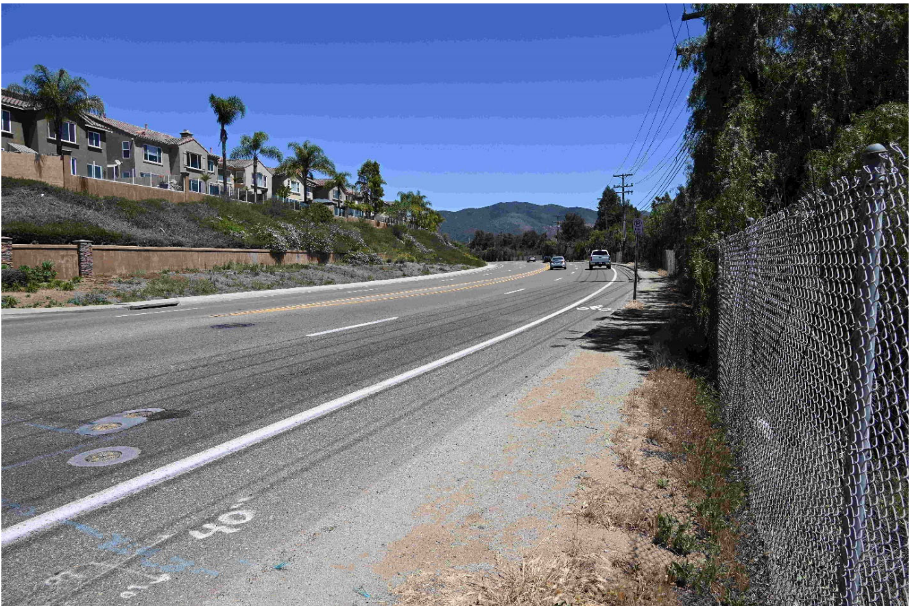
Figure 3. Looking East from Access to Willow Glen Drive