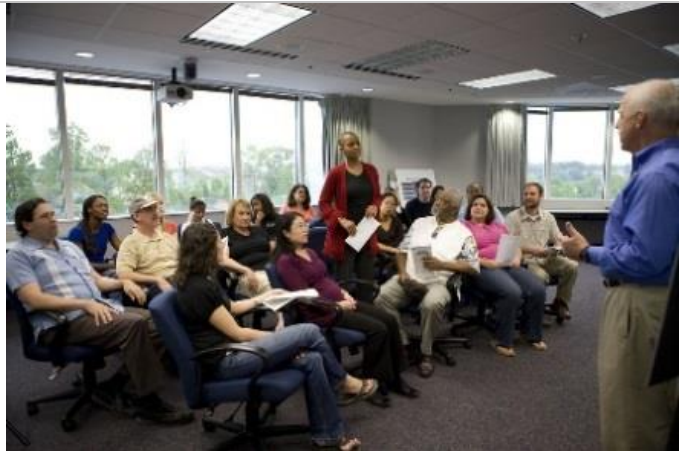
Stakeholder meetings provide a smaller venue for focused discussions.

County staff will consult broad groups of stakeholders throughout the unincorporated County. These meetings could include representatives of public agencies, business organizations, environmental conservation groups, and other interested parties. Meetings/briefings will include meeting with the chairs of the 26 Community Planning/Sponsor Groups.