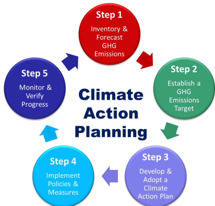
Figure 2: Climate Action Planning Process

Monitoring and verifying progress on the implementation of measures to reduce or avoid GHG emissions is an ongoing process. Monitoring begins once measures are implemented and continues for the life of the measures, providing important feedback that can be used to improve the measures over time.