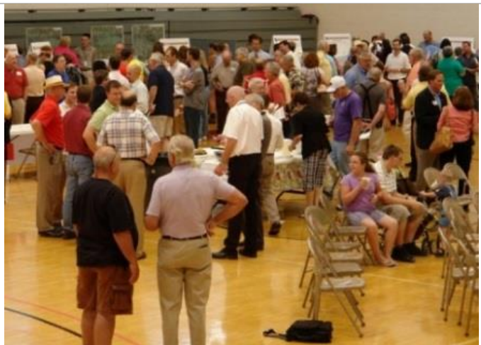
The planning team will host public workshops to provide the community an opportunity to learn more and provide input.

County staff will conduct two (2) public workshops at strategic times during the planning process where members of the public will be able to receive up-to-date information on the planning process and provide input at critical steps.