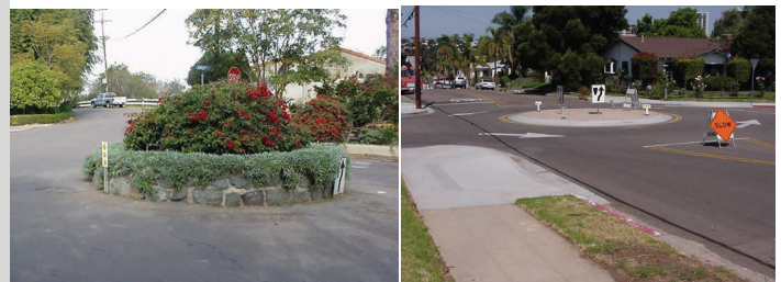
Old and new traffic circles, in Del Mar and North Park, respectively.

The Institute of Transportation Engineers found traffic circles reduce intersection collisions 70%. 5 Similarly, the City of Seattle studied 130 sites and found a 73% decrease. 6 These results stem from the sideways routing (“horizontal deflection”) of the travel path, which eliminates dangerous crash types such as head-on, left turn, and right angle crashes, 7 and discourages speeding. In Portland, traffic circles virtually eliminated speeds over 35 mph, where before, 15% or more of traffic exceeded 35 mph. 8 Traffic circles are unexpected, so proper signage and markings are important.