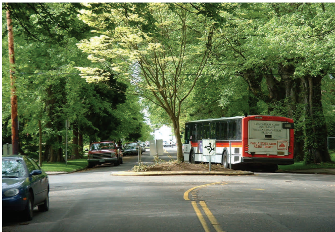
Large vehicles such as buses and fire trucks can comfortably navigate traffic circles, improving safety and reducing noise on residential streets.

Traffic circles (or “mini-roundabouts”) are circular intersection islands similar to modern roundabouts, usually installed in 2-lane streets . Unlike with roundabouts, the approach islands (“splitter islands”) are painted rather than raised. 1