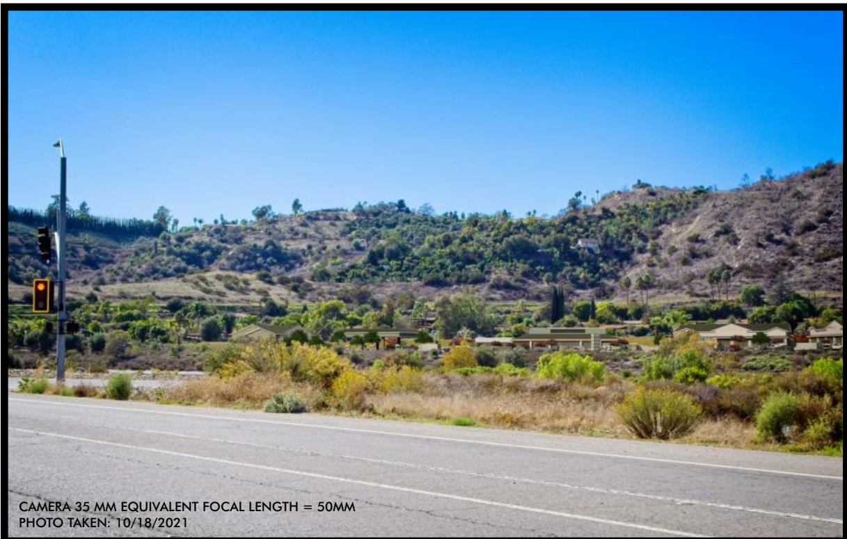
Project Simulation View

REMARKS: PROPOSED PROJECT VISIBLE AS SHOWN.