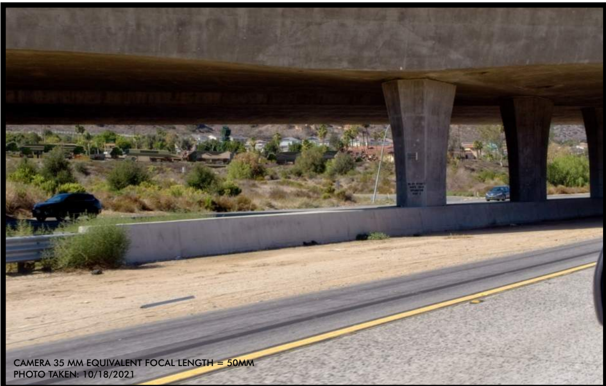
Project Simulation View

REMARKS: PROPOSED PROJECT VISIBLE AS SHOWN.