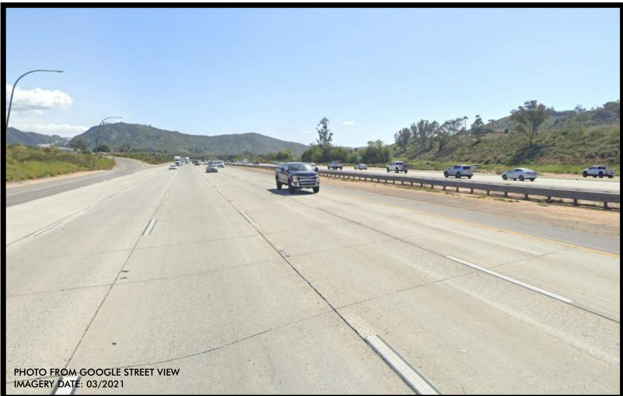
Project Simulation View REMARKS: PROPOSED PROJECT NOT VISIBLE.