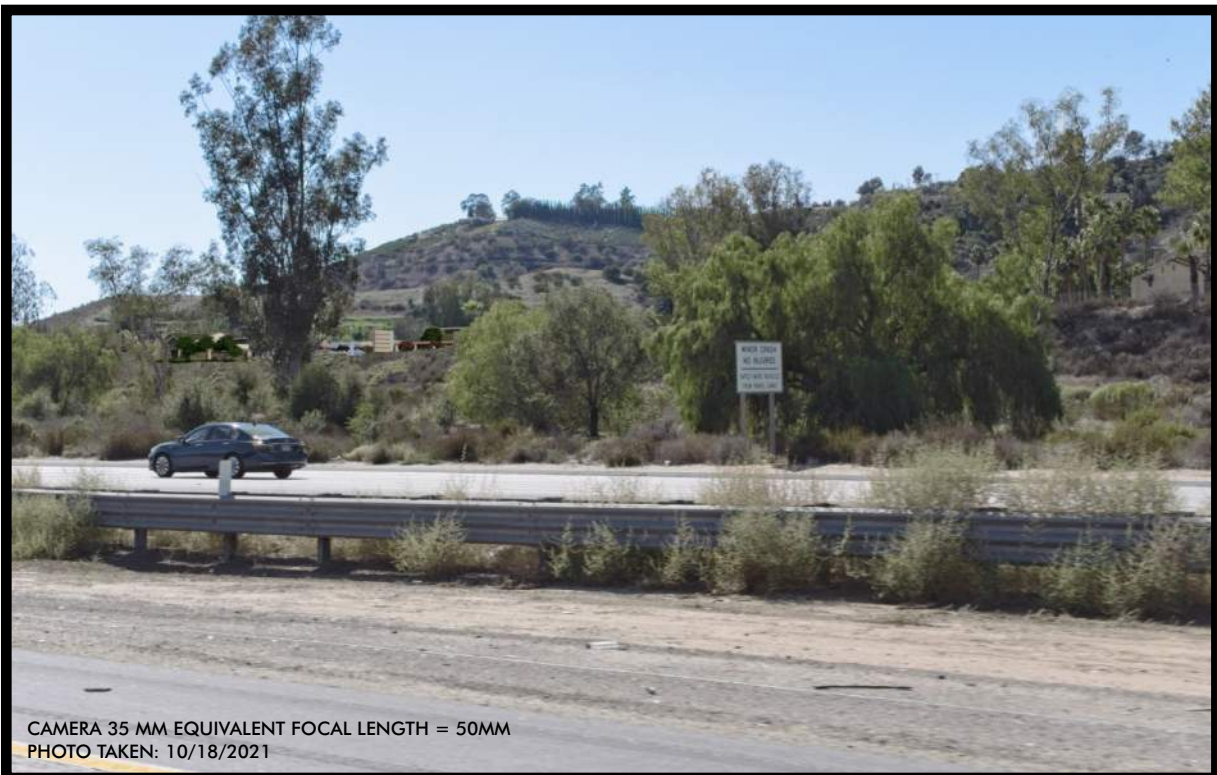
Project Simulation View

REMARKS: PROPOSED PROJECT VISIBLE AS SHOWN.