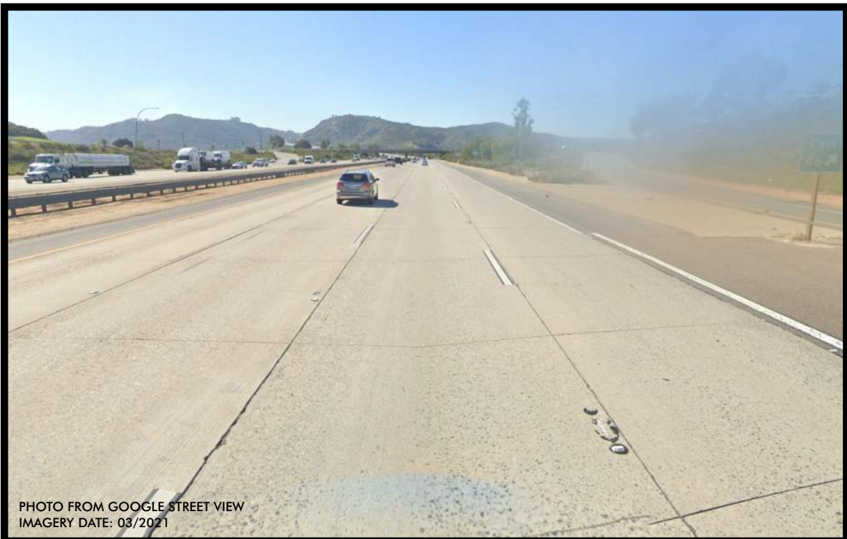
Project Simulation View REMARKS: PROPOSED PROJECT NOT VISIBLE.