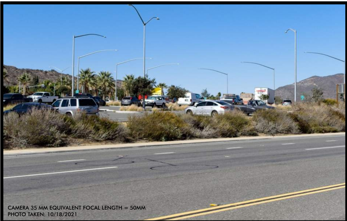
Project Simulation View REMARKS: PROPOSED PROJECT NOT VISIBLE.